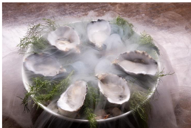
Fresh Pacific Oysters