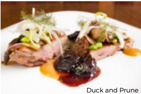
Duck and Prune