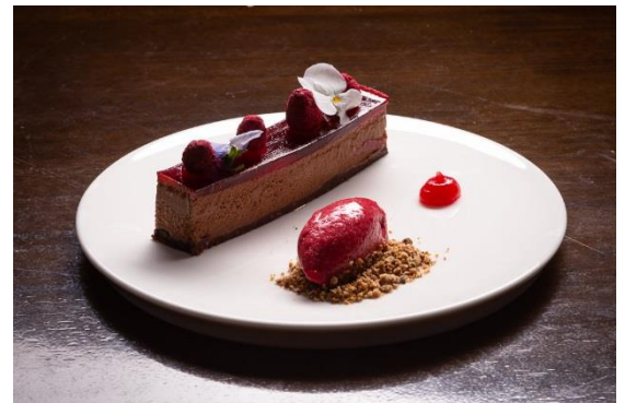
Chocolate raspberry delice